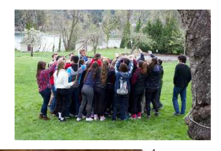
Heading out on a hike (above)