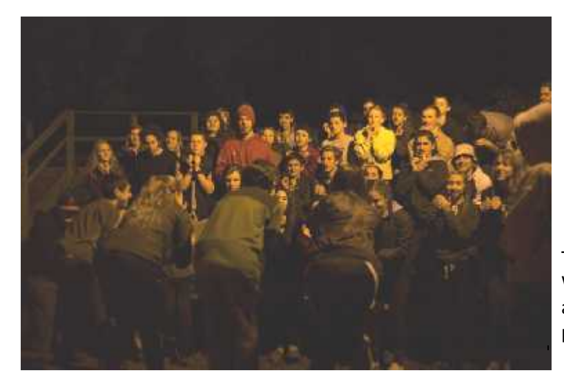
The retreat was held at All Saints Camp in Gig Harbor, WA. We had over 30 kids from Holy Trinity, St. John the Baptist, and Holy Apostles join the 30+ kids from the Seattle parishes—for a weekend of faith, fun, and fellowship!