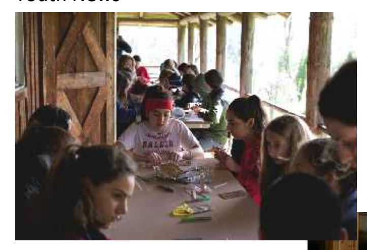
Junior and Senior Goyans at the NW Goya Retreat in Seattle March 27-29.