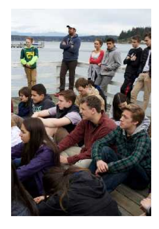
Having fun at campfire!