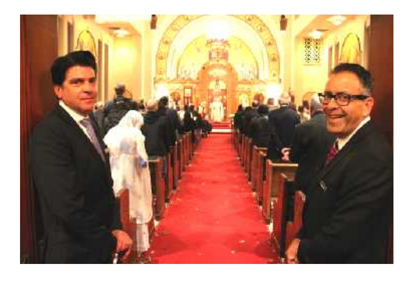
Holy Saturday night Resurrection Service