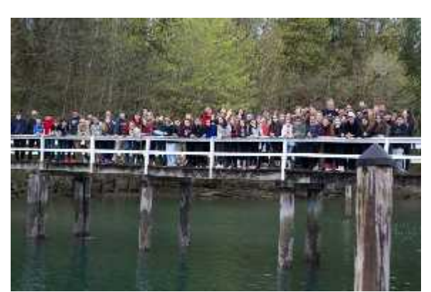
The entire group!