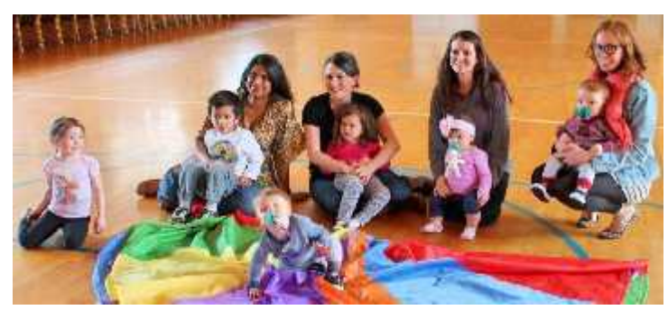
Join Little Angels moms and tots for fun and fellowship on Tuesday mornings from 10- noon in the gym.

GET EXCITED!!! CAMP ANGELOS 2015...HERE WE COME!!!