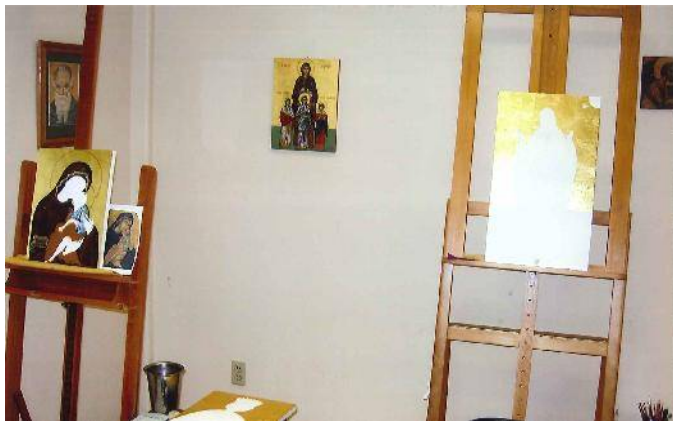
The room where icons are painted