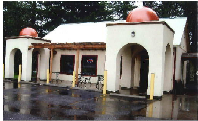
Entrance to the Bakery and Gift Shop