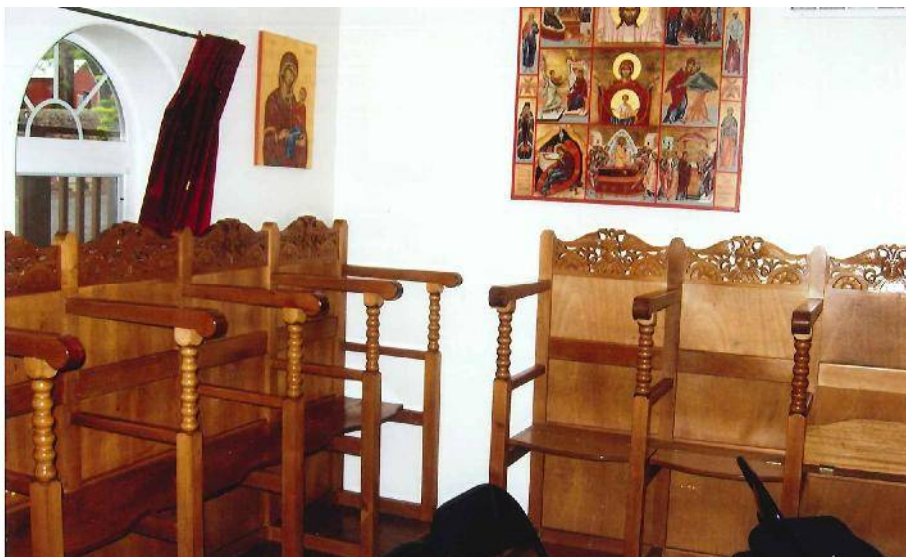
Seating in the Sanctuary